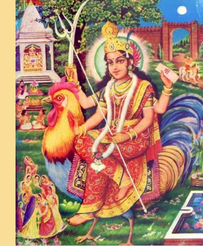
Cock is Vehicle of Goddess Bahuchraji