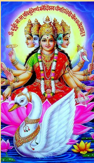
Eagle for God Swan for Goddess