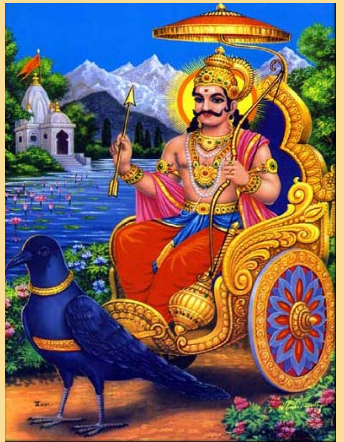
Crow is a Vehicle of Sani Maharaj

If we don't have vehicle of the God? How the God will come to us?