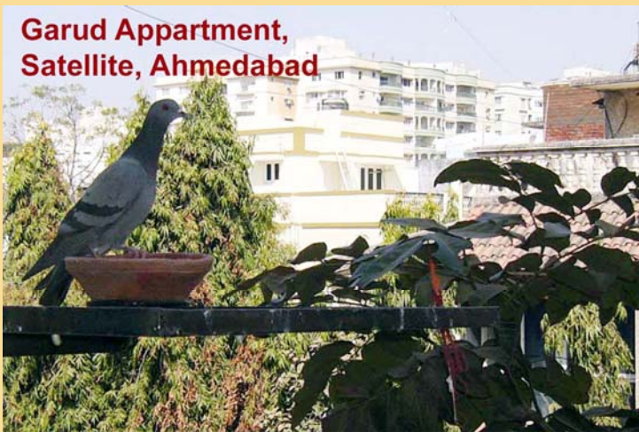
Garud Apartment, Satellite, Ahmedabad